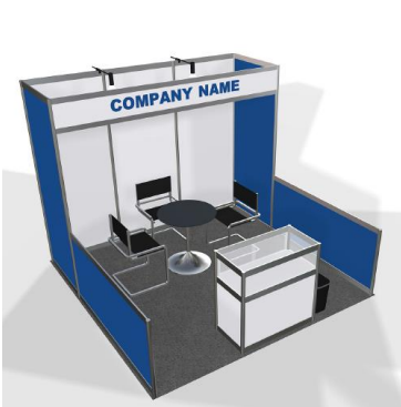
10' x 10'