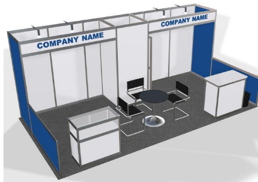
10' x 20'